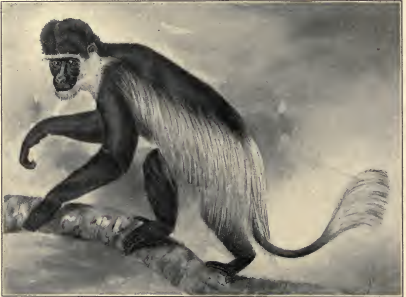
FIG XC. COLOBUS GUEREZA. THE GUEREZA.

Guereza ruppellii Gray, Cat. Monkeys, Lemurs & Fruit-eating Bats Brit. Mus., 1870, p. 19.